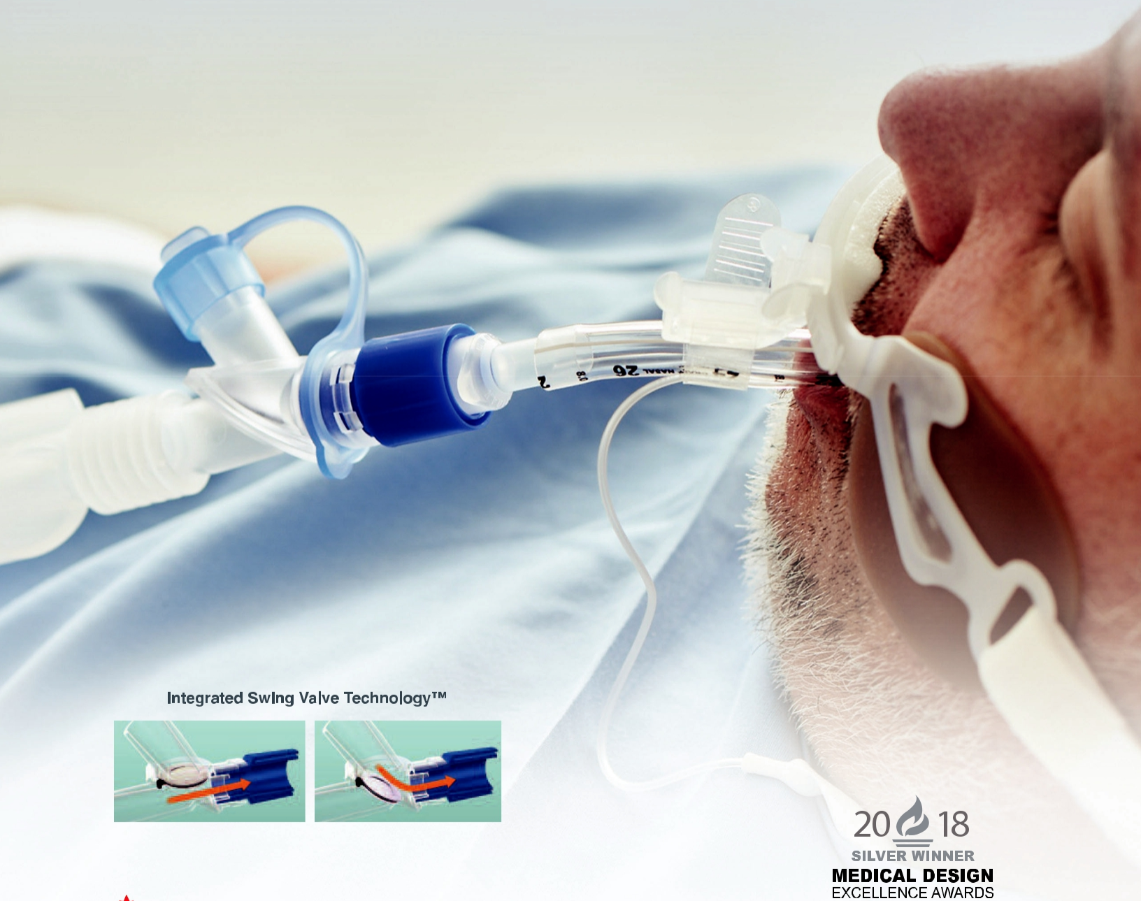
Integrated Swing Valve Technology™